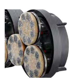
With single-head gear plate x BRUTALE48