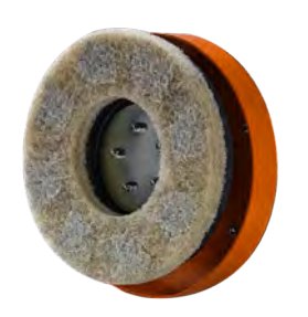
With manual grinding machine HANDY MACHINE