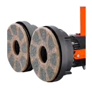
With two-head gear plate x CHIMAERA