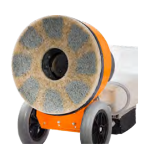
With single-brushes GREEN/LEADER/ MONSTER Line